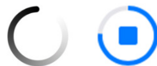
Figure 4: 'Loading spinning circles'

Press 'open' and it will bring you directly into your RTÉ News app.