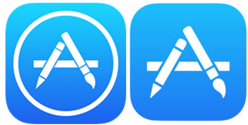
Figure 2: 'App Store'

If you do not have an Apple ID, tap “Create ID” and follow instructions.