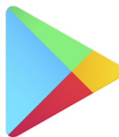
Figure 1: 'Google Play Store image'

You may need to sign into your Google account to access this if you have one. A Google account and a gmail account is the same thing, 'g' in gmail stands for Google. A gmail account is a brand of email (an electronic mail). You can find out how to create a gmail account from Age Action's How to...Create an Email guide.