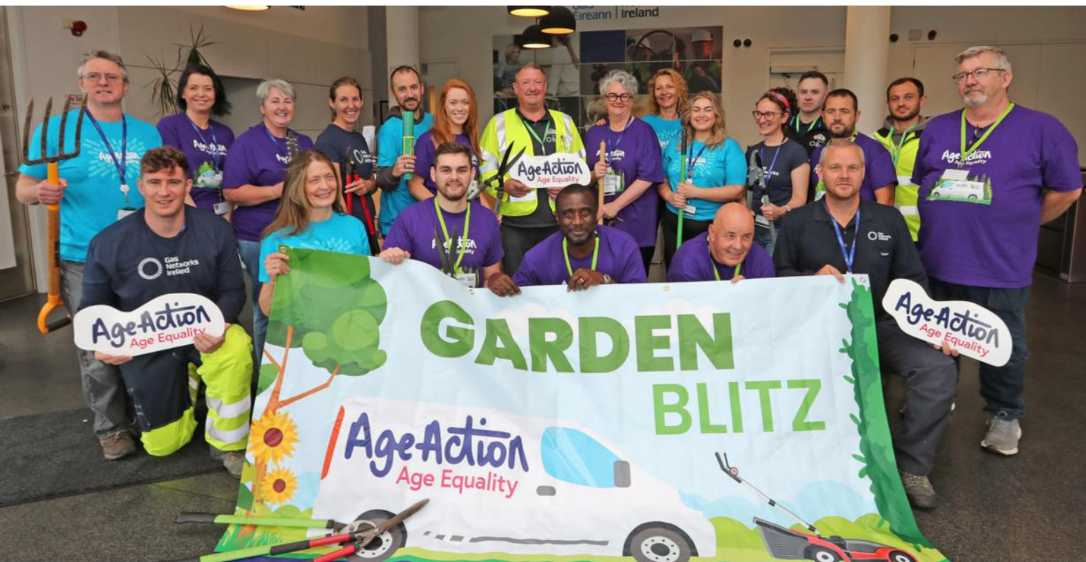
Age Action staff members with Volunteers from Gas Networks Ireland taking part in the Garden Blitz in Cork

By partnering with organisations like Gas Networks, Age Action continues to make a positive impact in the lives of many.