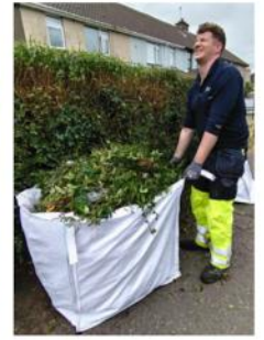
Volunteers from Gas Networks Ireland and Age Action team members hard at work during the Cork Garden Blitz