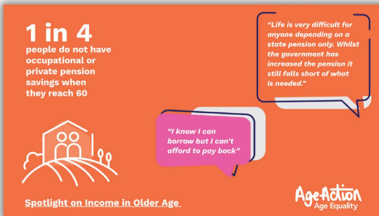
Visual from Spotlight on Income in Older Age

Age Action's Spotlight on Income in Older Age tells the story of older persons' experience of income and living costs. The report shows us that most older persons are deeply reliant on the state pension and social protection generally, to a greater extent than the rest of western Europe. 3 in 10 people aged 66+ rely on social protection for over 90% of their income and a further 4 in 10 people aged 66+ rely on it for more than half of their income.