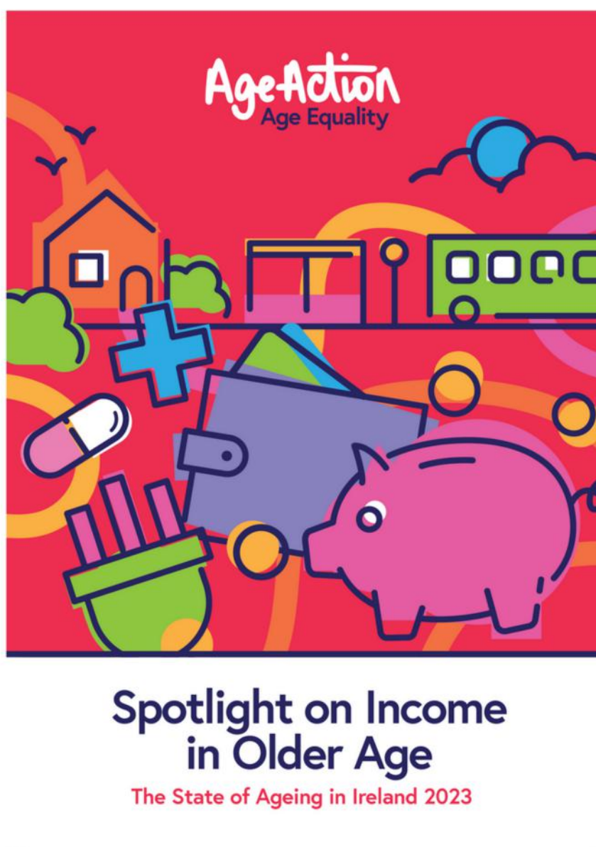
Cover image of Spotlight on Income in Older Age

“Age Action’s Spotlight on Income in Older Age tells the story of older persons’ experience of income and living costs”